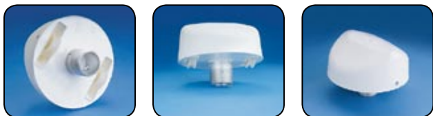
For External Halyard Poles • Threaded Type • Stationary • Double Pulley

Molded fiberglass construction with 3/4" outside diameter nylon pulley on a 3/16" stainless steel axle. The stem of the truck is designed to slip into a 2" inside diameter pole top and is held in place by drilling thru the pole and securing the truck to the pole with an appropriate size bolt or screw (not included). The top of the truck is designed to accept an ornament with a spindle threading of 1/2"-13NC. Maximum halyard size is 1/4".