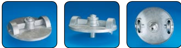
For External Halyard Poles • Threaded Type • Revolving • Double Pulley