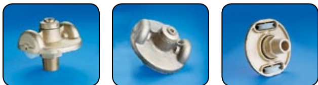
For External Halyard Poles • Threaded Type • Revolving • Double Pulley

Cast aluminum construction with 2" outside diameter aluminum pulleys on 3/8" stainless steel axles. This truck is designed to be used on flagpoles that have up to a 4" outside top diameter with female fitting installed. The bottom of the spindle has a 1 1/2" NPT threading and is screwed into the top of the flagpole while the top spindle is designed to accept an ornament with a spindle threading of 1/2"-13NC as standard but can be supplied with other sizes of threading. The ornament is secured to the truck with a 1/4"-20NC stainless steel set screw. The truck body rotates on 26 stainless steel ball bearings on cast races. Maximum halyard diameter is 5/16".