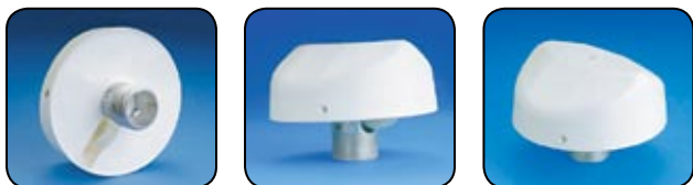
For Internal Halyard Poles • Threaded Type • Stationary • Single Pulley

Molded fiberglass construction with 1 1/2" outside diameter nylon pulleys on 1/4" stainless steel axles. The top of the truck is designed to accept an ornament with a spindle threading of 1/2"-13NC as standard but can be supplied with other sizes of threading if desired. The aluminum spindle is threaded 1 1/4" NPT. Maximum halyard diameter is 5/16".