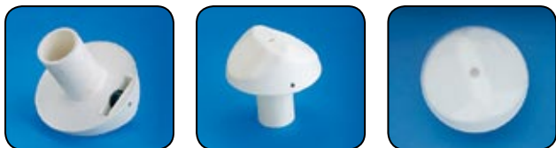
For External Halyard Poles • Slip Fit Type • Stationary • Single Pulley

Cast bronze alloy construction with 2" outside diameter nylon pulleys on 1/4" stainless steel axles. This truck is designed to be used on flagpoles that have up to a 4" outside top diameter with female fitting installed. The bottom of the spindle has a 1 1/4" NPT threading and is screwed into the top of the flagpole while the top spindle is designed to accept an ornament with a spindle threading of 1/2"-13NC as standard but can be supplied with other sizes of threading. The ornament is secured to the truck with a 1/4"-20NC stainless steel set screw. For additional ease of rotation, product life and strength, these trucks utilize stainless steel sealed lubricant ball bearing assemblies. Maximum halyard diameter is 5/16".