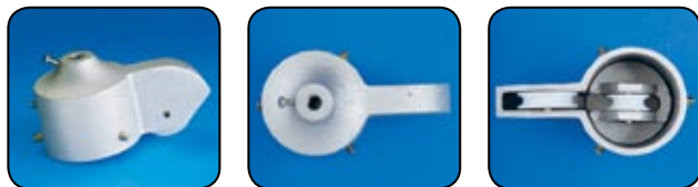
For Internal Halyard Poles • Cap Style • Stationary • Single Pulley