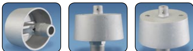
For Internal Halyard Poles • Threaded Type • Stationary • Single Pulley