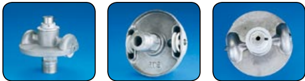
For External Halyard Poles • Threaded Type • Revolving • Double Pulley