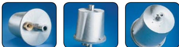
For Internal Halyard Poles • Threaded Type • Revolving • Single Pulley