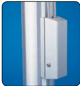
With Cylinder Lock