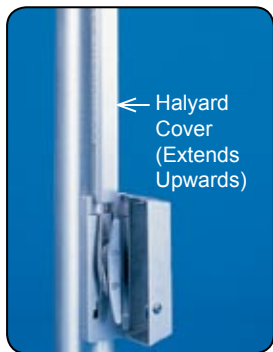
← Halyard Cover (Extends Upwards)