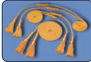
Cord & Tassel